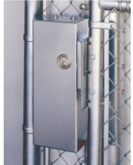
8055 gate lock shown in closed and deadlocked position. When the gate is closed, the locking bolt is completely concealed.

Since Chain link fence construction varies, R.R. Brink Locking Systems, Inc. suggests consulting with the factory for each application. Please verify the diameter of fence and gate posts prior to contacting the factory.